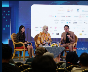
Educational Programs Grab Run Grow