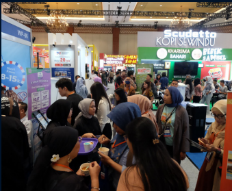
Exhibition Local & International Brands